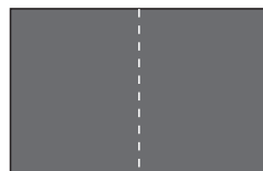
Spread 16 1 / 4 "(W) × 10 3 / 4 "(D)